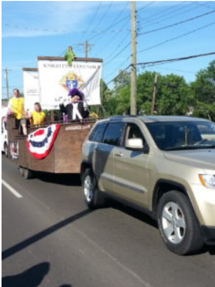
Bealer Council participated in the Memorial Day Parade.