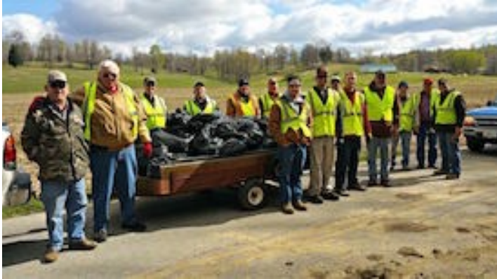
Council #16125 in Knottsville picked up trash over 5 miles of highway to raise $650 for various causes they will donate to this year.