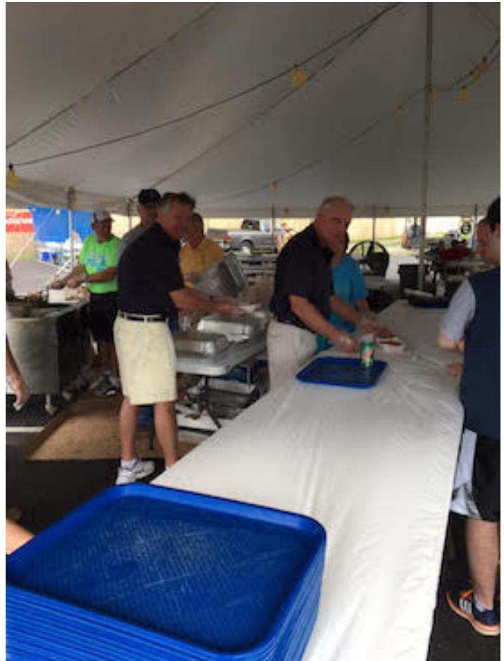
10 bishop Flaget knights 13053 in action at the food tent at Ascension Parish in Louisville.