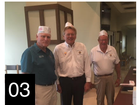
Burgers for the Homeless