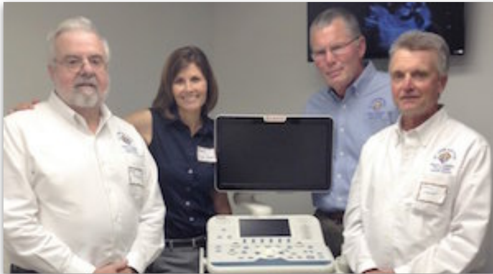
Brothers from council 10682, St. Louis Bertrand, purchased an ultrasound machine for the Little Way Pregnancy Resource Center on Oak Street in Old Louisville. Full story on page 3.