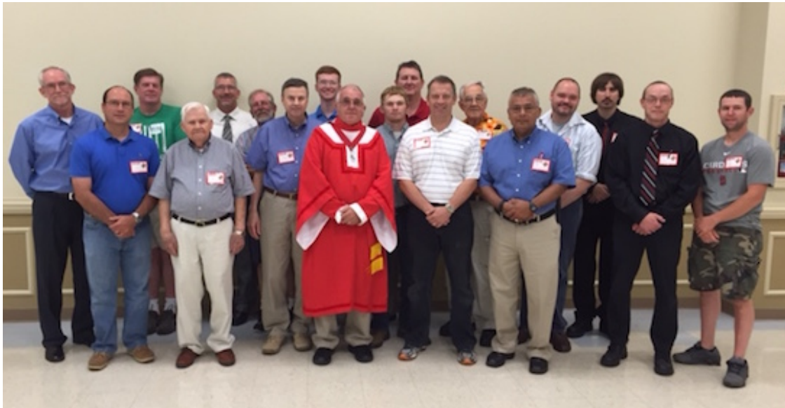
Divine Mercy Council 11591 in Paducah held a 2nd/3rd Degree Exemplification, on Saturday, June 18th at St. Thomas More Parish Hall.

Council 14130, Christ the King, in Lexington delivered supplies to Catholic Charities in Elkview, WV.