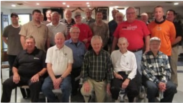
Council 3908 Elsmere