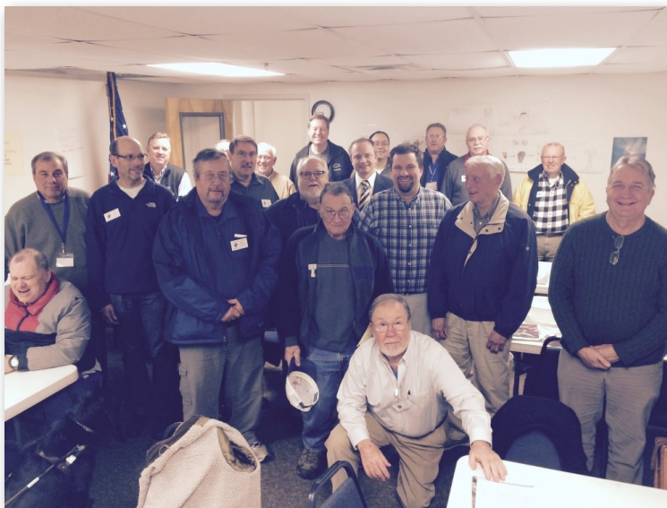
Council 15613 Lexington