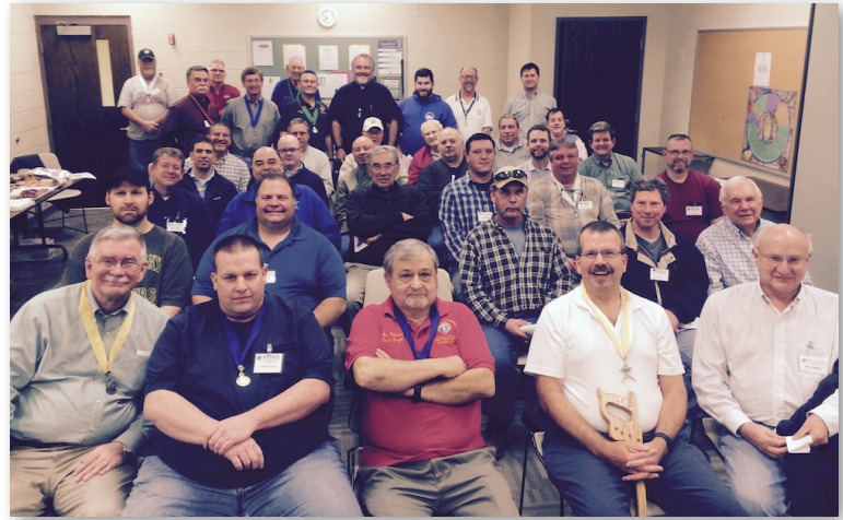
Council 14372 Lexington