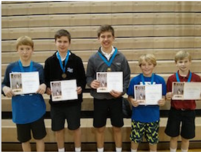
Christ the King Council #14130 in Lexington recently held their council's free throw contest. Good luck to the winners as they continue on to the district contest.