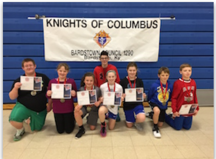
Bards town council #1290 held their Free Throw Contest.