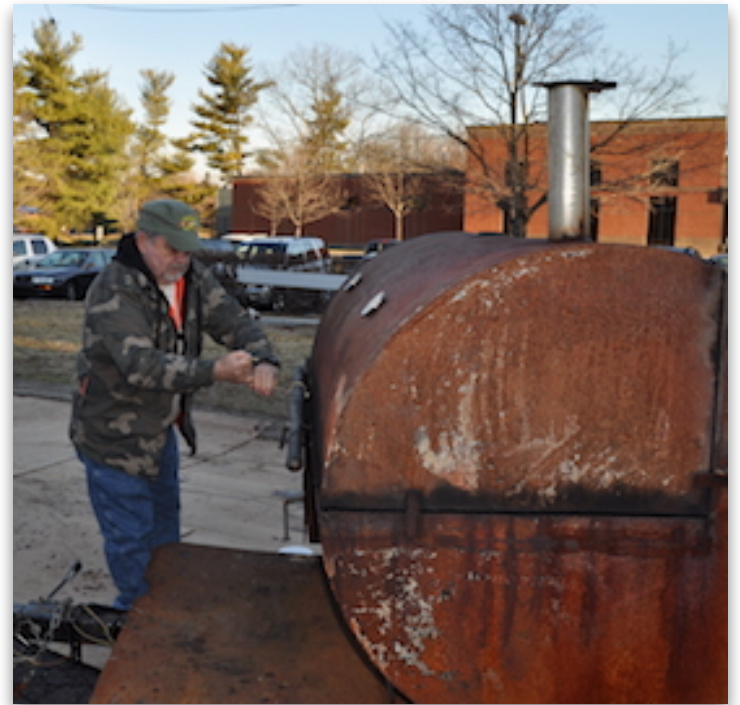
The brothers of Mary Queen of the Holy Rosary Council 14372 in Lexington held their annual pulled pork fundraiser. They smoked almost 1,000 lbs of pork shoulder and then pulled the pork by hand and separated it into 1 lb bags. They did pre-sales after Masses the two weeks before and delivered the pork on Super Bowl Sunday.