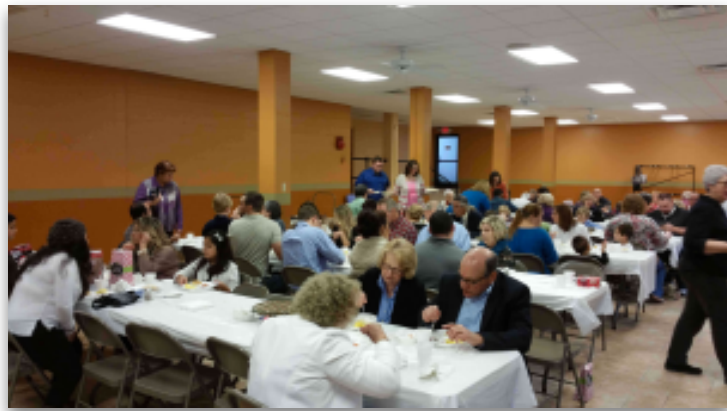
On December 13th Council #1055 in Paducah held a breakfast at St. Rose of Lima. They had a lot of fun and believe they made quite an impression with the church.