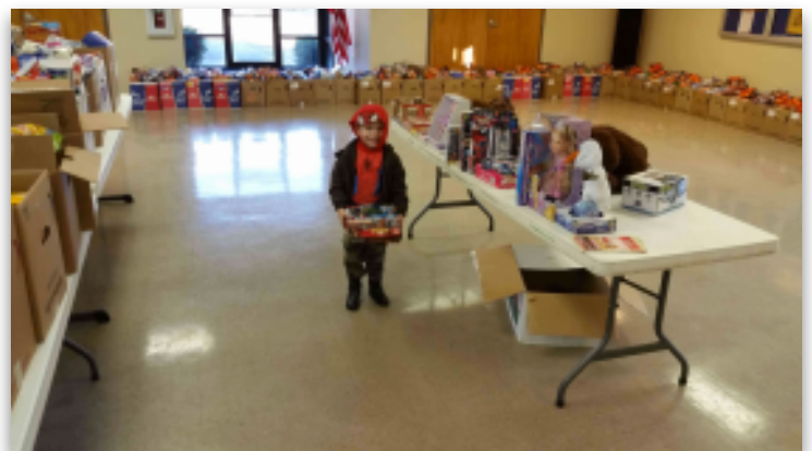
On December 18th Council #1055 in Paducah put Christmas baskets together with the help of students from St. Mary's. WOW those kid's were like a tornado we pack all of the boxes in roughly thirty minutes!!!