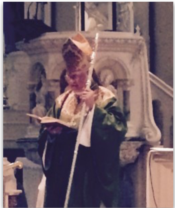
On Sunday January 17th Archbishop Kurtz celebrated a Mass for all human life. The Mass was sponsored by the Knights of Columbus but was open to all and the turnout was great. Every seat in the church was taken.