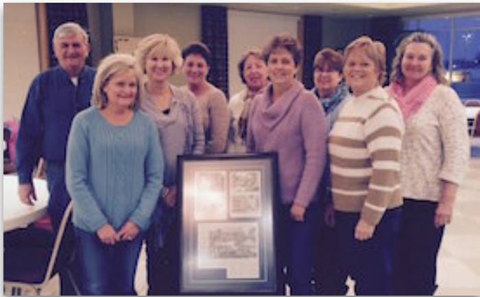
Wives of Council 1483 pack up Friday fish fry meals and bring them to homebound local residents.