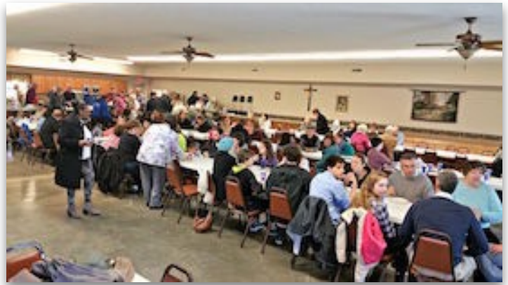
Council 16125 in Knotsville held a pancake breakfast and brought in $450 in donations. Lots of nice comments about the event and they served over 100 people.