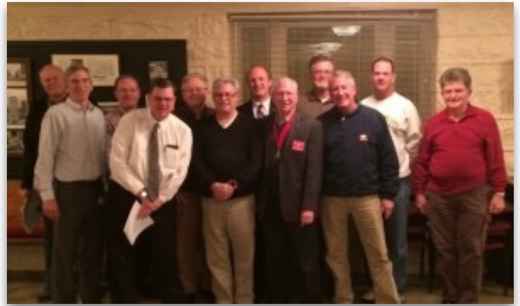
Council 16197 raised $670 in their first Tootsie Roll drive.