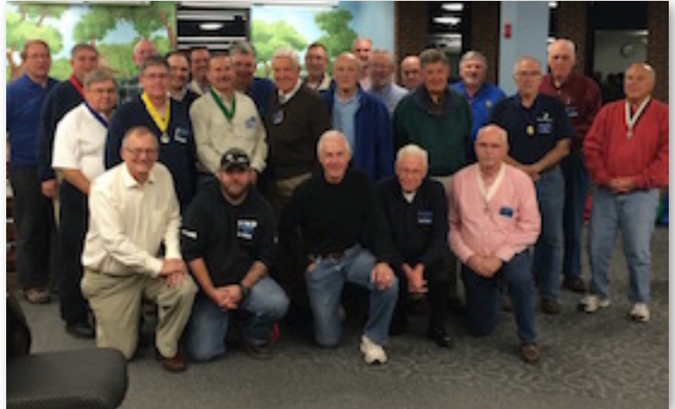
Council 13917 Versailles