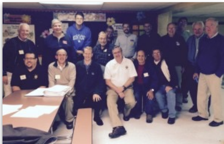
council 11470 in Georgetown raised $ 1500 in their tootsie roll drive.