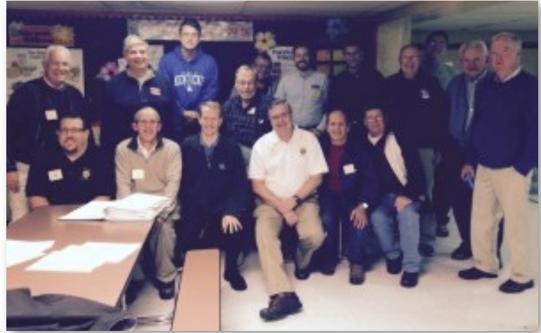
Council 11470 Georgetown