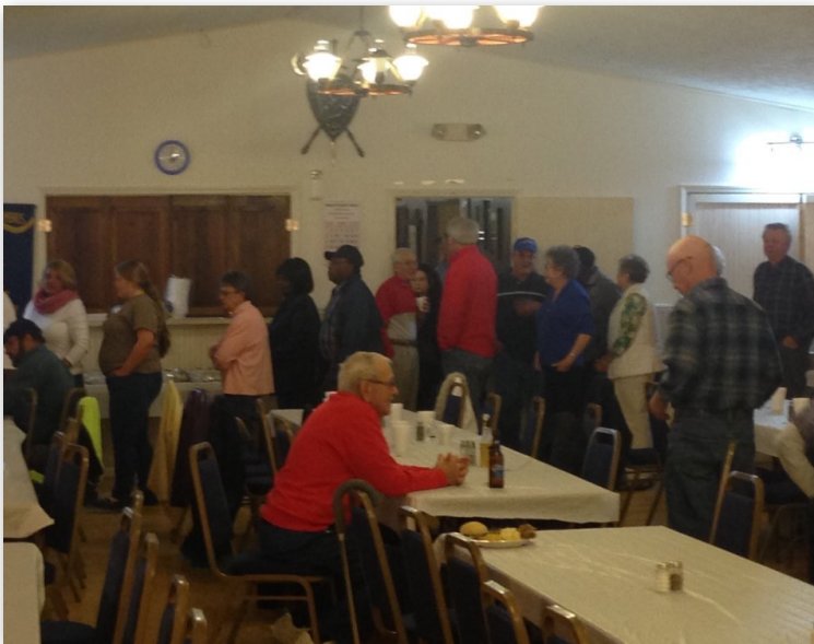
Council 1367 Uniontown