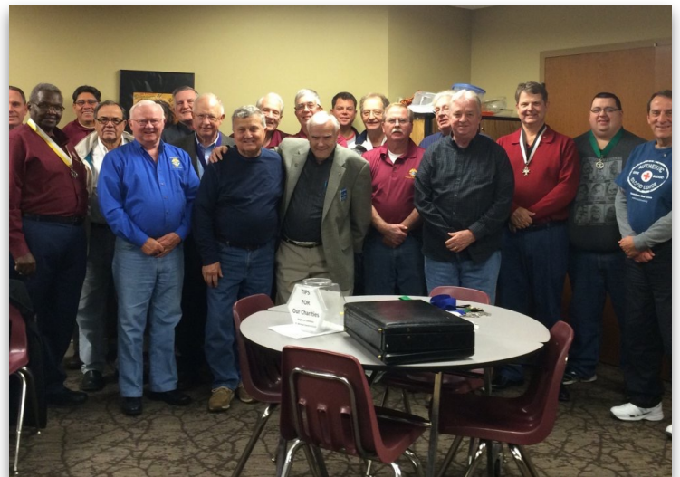
Council 15525 in Jeffersontown gathered 600 Winter Coats to be given to needy children.