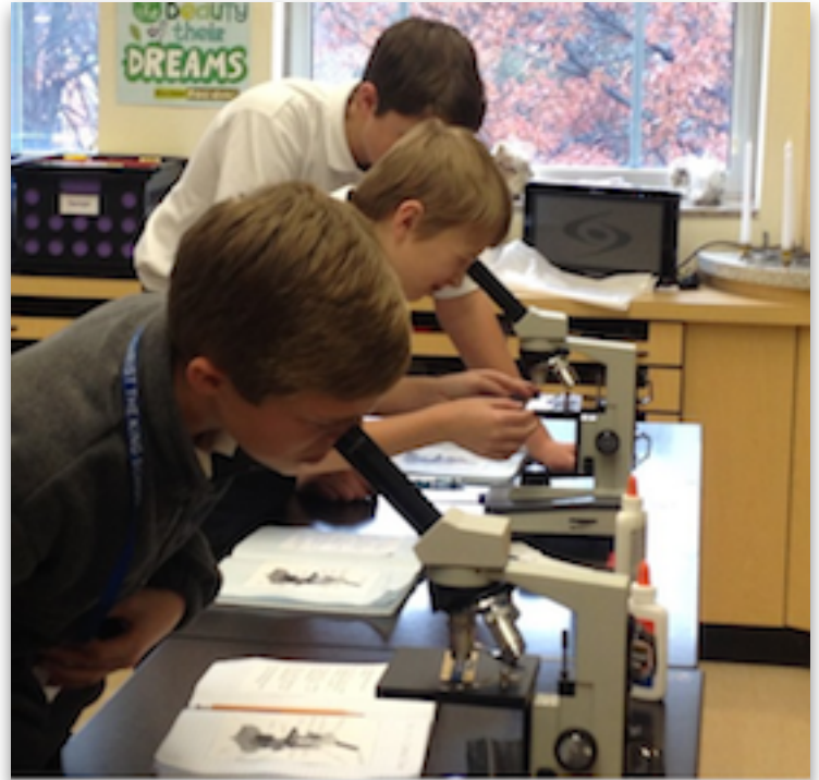
Council 14130 Christ the King in Lexington donated four microscopes to the school for use in the middle school science lab.