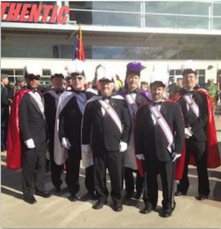
Our brother Knights marched in the Veterans Day Parade in Louisville on November 11th.