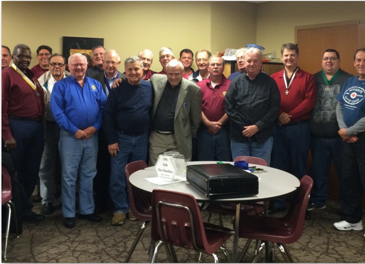
Council 15525 Jeffersontown