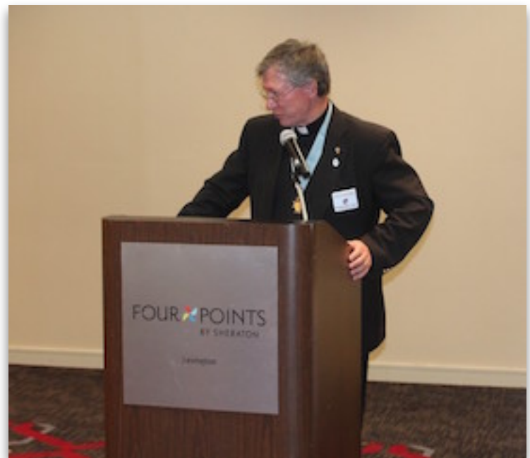
Everyone enjoyed themselves at the the banquet.