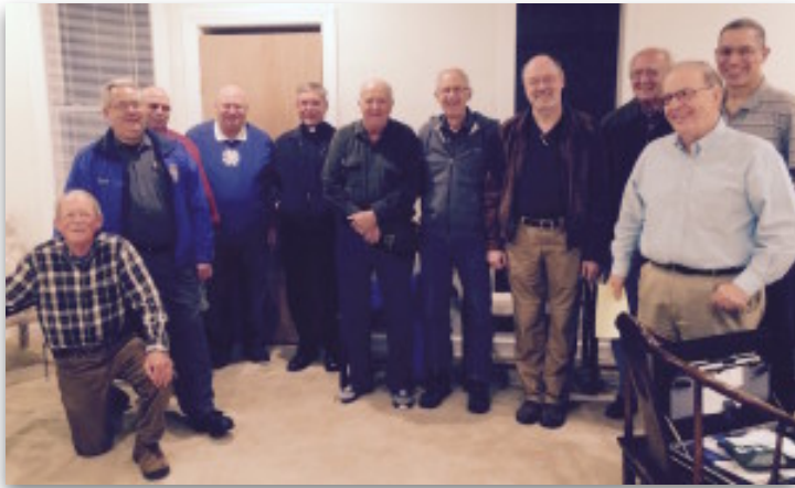
Council 7847 in Hopkinsville gave the parish school PTO $500 for basketball uniforms and raised $2,200 for the tootsie roll drive.