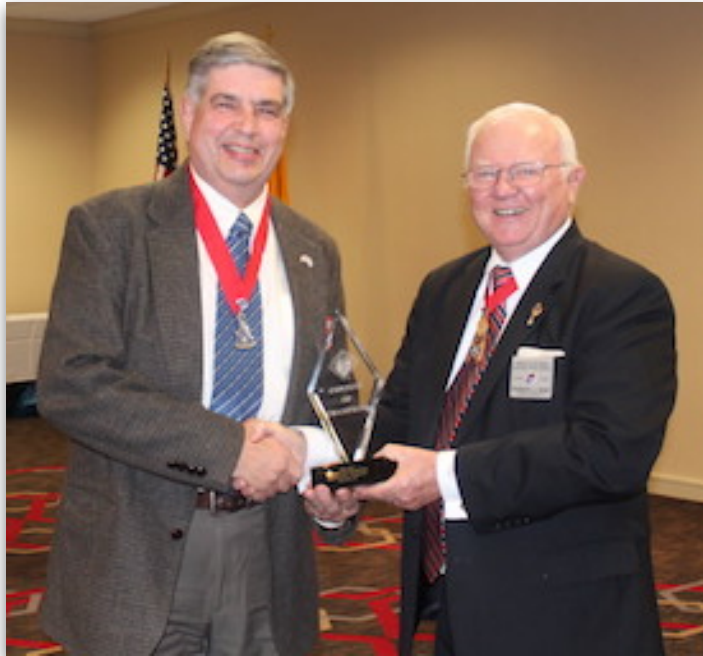
The mid year meeting was held at the Four Points Sheraton in Lexington on December 4th-6th. The full story on pages 3-7.