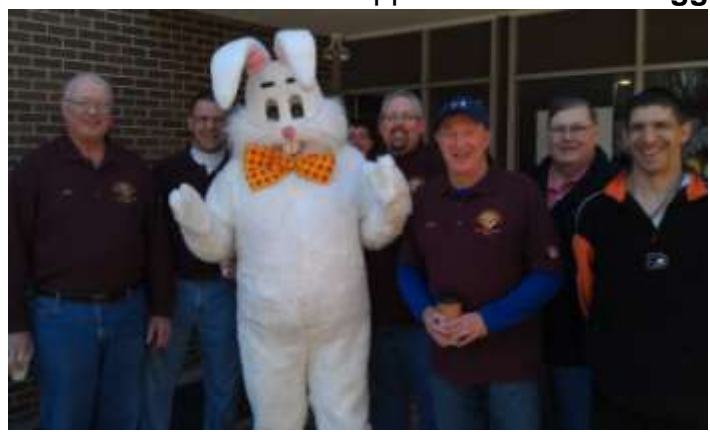
Hunt on Saturday, 4/30/2013.

The Brother Knights of Saint Jude Council 6551 were asked to support the Easter Egg