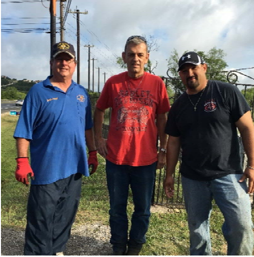
Cemetery Crew cleaned up the cemetery on May 7th