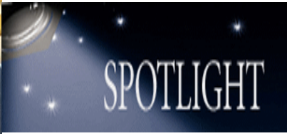
FIGURE 1 MEET OUR KNIGHT