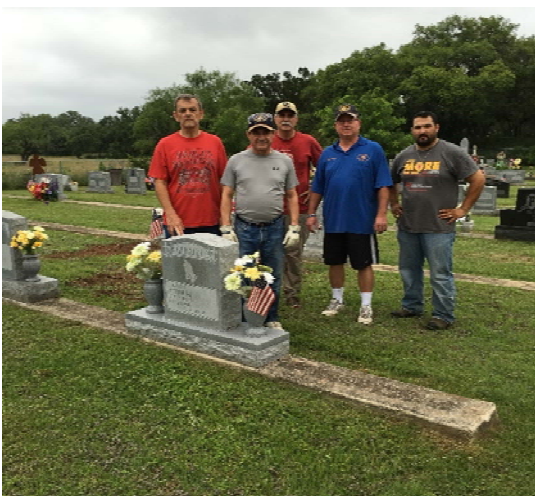
This crew Cleaned up the cemetery for Memorial day.