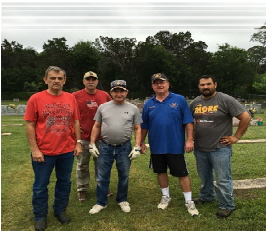
Note: Big Al Garcia is not pictured, but mowed the cemetery the last two times.