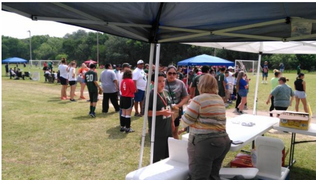
Food Serving Booth for over 100 Participants