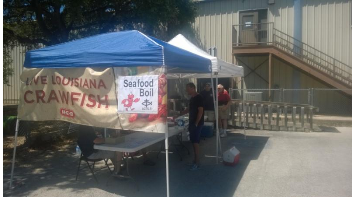
SEAFOOD SERVICE STATIONS