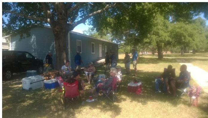
Members from ACTS/ Recovery