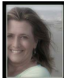
Kimberly Conca Memorial Foundation

Our Council, in conjunction with the Knights of Columbus, Arizona State 2011 Charity Raffle raised the second highest amount of money ($11,025) in their raffle sales effort. A check for $2756.25 was presented to each of our selected charities; The Kim Conca Memorial Foundation at St Joseph Carondelet and