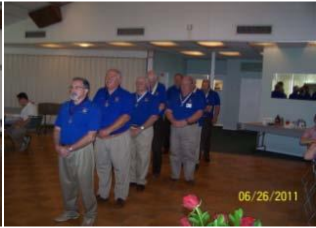
Officers sworn in