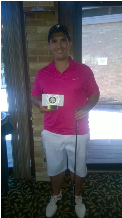
Winner - Closest to the Pin