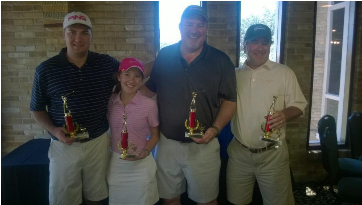
2 nd Place Low Net