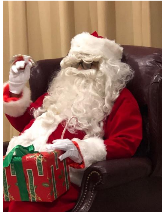
SANTA DECIDES IT’S NOT HIS PRESENT