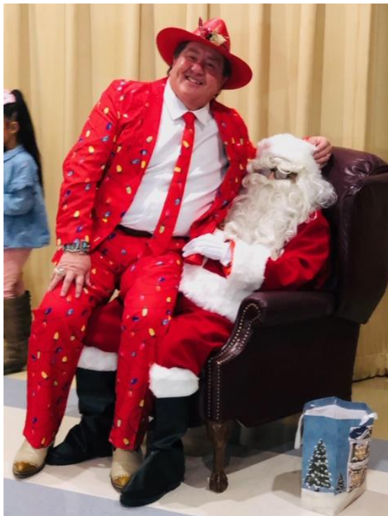
THE FIRST “ZAPPY” KID TO SIT ON SANTA