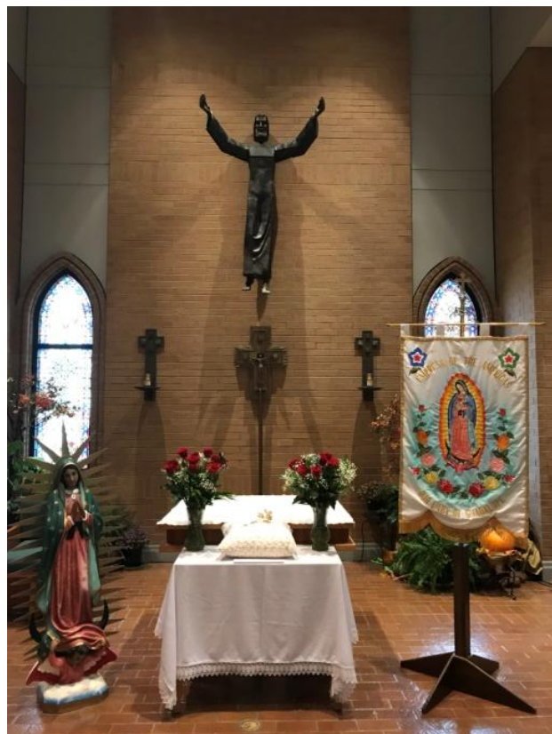
Silver Rose, representing Our Lady of Guadalupe