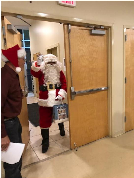
“HO HO HO” HERE COMES SANTA