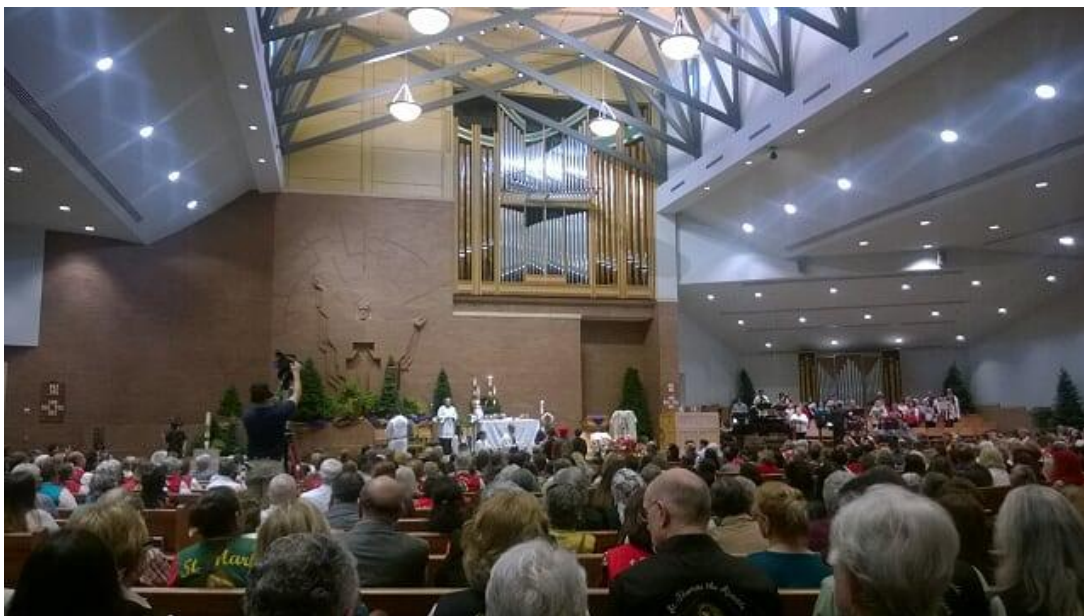
St Mark's hosting Archbishop Gustavo presiding Virgin de Guadalupe Mass