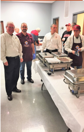
Council Members Prepare To Serve The Smoked Brisket Parish Meal At The 2018 Priest Appreciation Dinner Nov 18th

Santa and Mrs. Clause are stopping at our parish to visit with you and your family. Enjoy a delicious breakfast of Biscuits and Gravy, Scrambled Eggs, Sausage and Fruit served up by the SFX Knights of Columbus Council at the Parish Center on Sunday, Dec 9 th from 8:30 -11:00 am. Throughout this breakfast children are invited to sit on Santa's lap and tell him just what they'd like for Christmas this year! Parents are encouraged to bring a camera to capture the moment – it will be a great photo opportunity and lots of fun! Some of your favorite Christmas movies and Christmas music will also be playing. Proceeds of this breakfast with children and for children will be directed to our Knight's Educational Scholarship fund for students within this parish. Walk-ins are welcome. No reservations are needed.