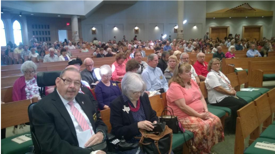
October 30th, 10am Mass