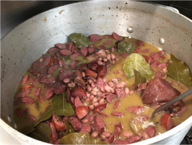
Beans, Sausage & Special herbs