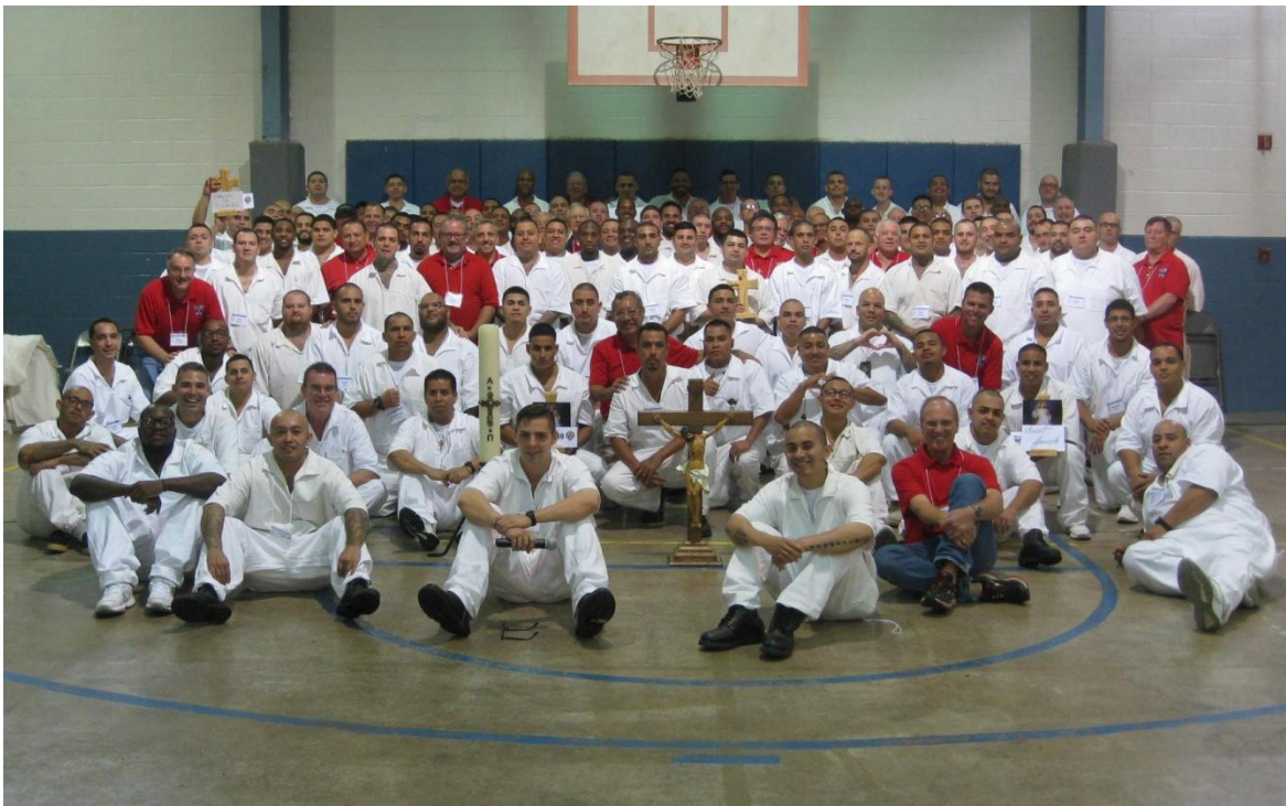
Briscoe Prison Inmates