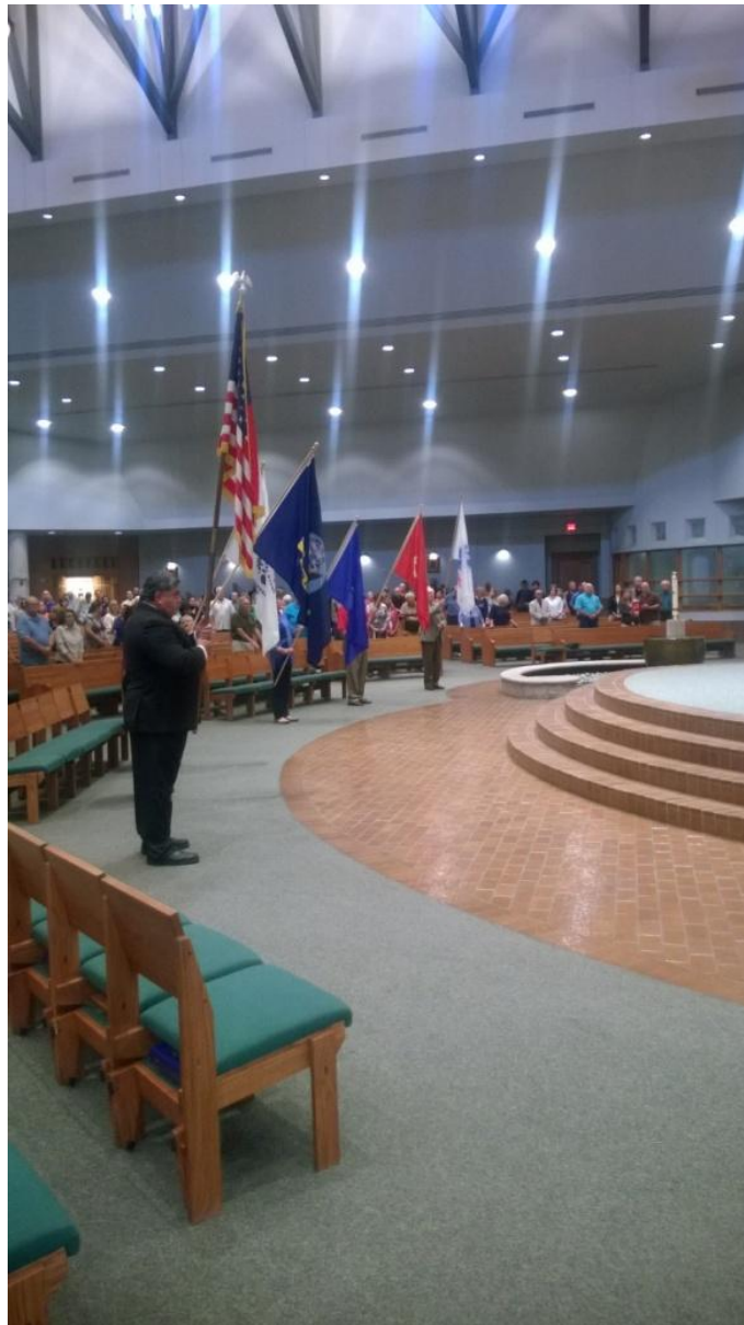
Opening Military Flag Ceremony, 5 pm Mass, 11/5