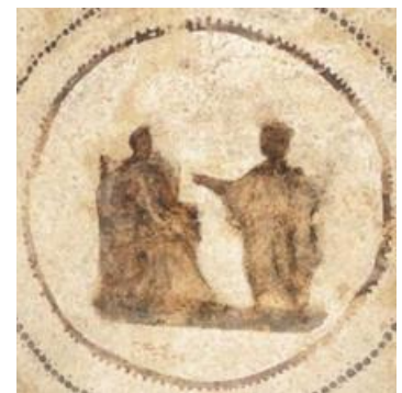
Solemnity of the Annunciation of the Lord GOSPEL 3/25/21 LUKE 1:26-38 Catacombs of Priscilla circa 250