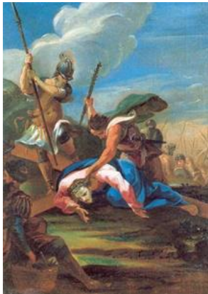
Jesus Falls for the Third Time