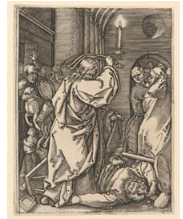
3 rd Sunday of Lent GOSPEL 3/7/21 JOHN 2:13-25 Wood print by Marcantonio circa 1500