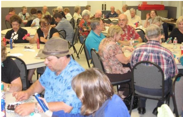
Another full house as everyone is anxiously awaiting the next bingo number.