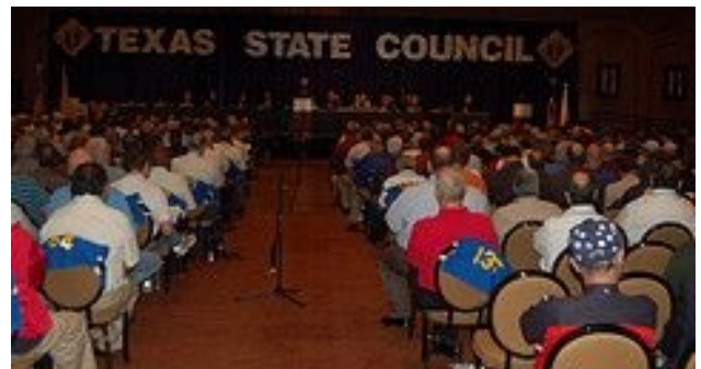
Plenty of seats were filled at the Downtown Sheraton as the State Convention begins.