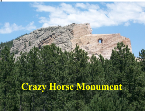
Crazy Horse Monument