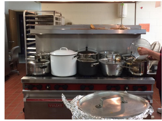
St. Patrick's Day Party