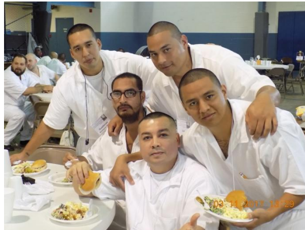
Men enjoying the pulled pork sandwiches

Since the retreat, we've had more men sign up to serve as regular volunteers at the prison, they took the Texas Department of Criminal Justice training and are now approved to enter and exit the unit. We've had 11 more men register for RCIA classes, and the Catholic Services at the unit are filled to capacity. Each of these things are a blessing to these men and their families. Please continue to pray for them, and pray for Council 7613 that we continue to do what Jesus would do.