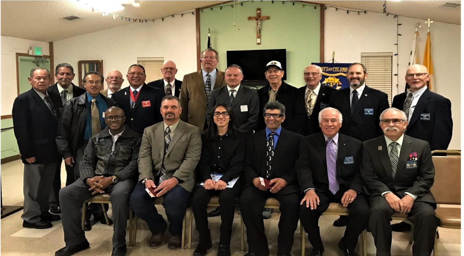
ADMISSION DEGREE EXEMPLIFICATION CREW WITH NEW BROTHERS AND SIDELINERS