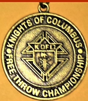
2018 District Medal

Council Members Who Helped With The Basketball Free Throw Events