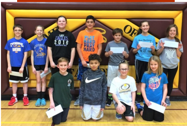
2017 District Winners