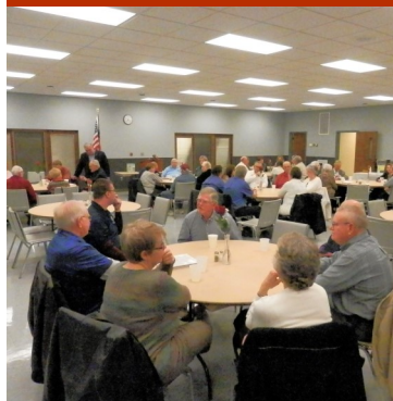
The Assembly 569 Covered Dish Dinner Meeting At St Francis Xavier Council Usually Attracts a Large Annual Attendance