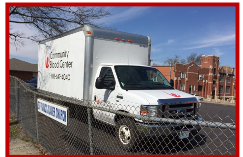
Next Bi-Monthly Parish Blood Drive is Tuesday, Feb. 6th at 1-5 PM in the Parish Center