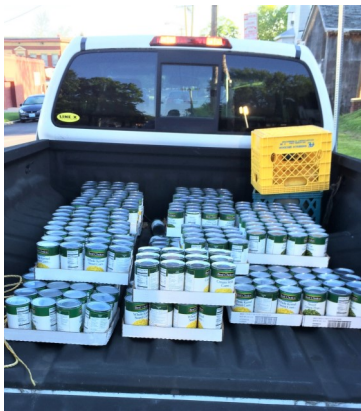
A portion of Our Council's 40 Cans For 40 Days Food Donation To SFX House of Bread During Last Year

For every 1000 pounds of food donated, we will receive a $100 rebate from Supreme. Let's make our Council goal to top 3,000 pounds for the first time ever this year, which will get us a $300 rebate! THANK YOU FOR YOUR CONTINUED DONATIONS.