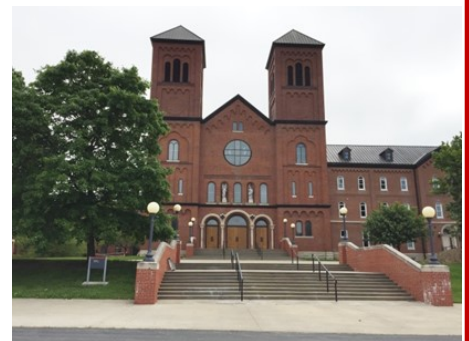
The Immaculate Conception Basilica Located at Conception Abbey—Site of the 2nd and 3rd Degree Exemplifications on Jan 28th

All Knights who have completed the 3rd Degree by Jan 28th are eligible to attend the 4th (Patriotic) Degree Exemplification on Saturday, Apr 14th beginning at 10:30 am at the Airport Hilton Hotel in Kansas City, MO. Attendance at this annual regional statewide Exemplification requires a prior application to and a recommendation from the St Joseph 4th Degree General Assembly 569 to which all St Joseph 4th Degree Knights belong for membership purposes (annual Assembly dues are $15). Cost of the 4th Degree Exemplification is $70 plus $10 for a 4 th Degree suspender Baldric. Uniform for this Exemplification is a dark suit, black shoes, white shirt and dark tie (no tuxedo is required for this year)!