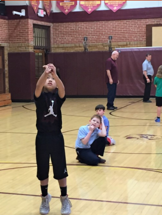
Council 15126 Free Throw Competition In The SFX Gymnasium in 2017