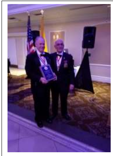
Corpsman of the Year