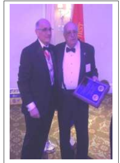
Fred J Conforti Award

I invite all 3 rd Degree members to join the Fourth Degree of the Order. The next Exemplification of the Fourth Degree in the First NJ District is Sunday, April 23, 2017 at the Sheraton Tara in Parsippany.