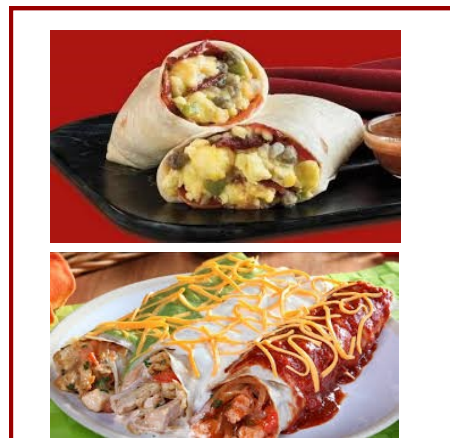
Enchiladas & Burrito Sales Oct 28th & 29th