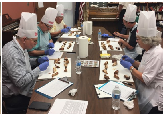
Our Awesome Celebrity Judges