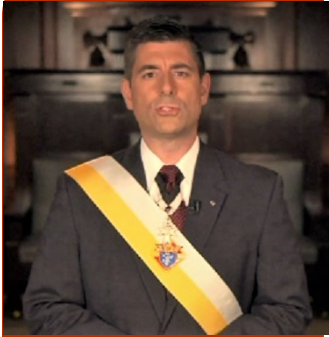
A Preview of New Council Admissions Degree Team Ceremonial Uniforms