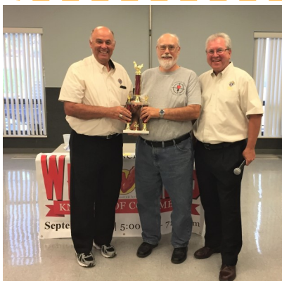
2nd Place Wings—Bldg & Grounds