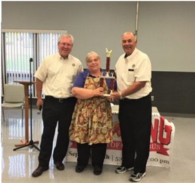
The St Francis Xavier Knights of Columbus Council sponsored the 2 nd Annual Wing Ding Ministry