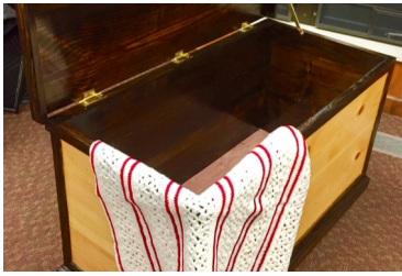
Cedar chest and afghan.

In order to boost attendance at the Lenten Meals and have another venue for raising funds to donate for Knights of Columbus supported activities, this year council 15126 will be holding a raffling during the