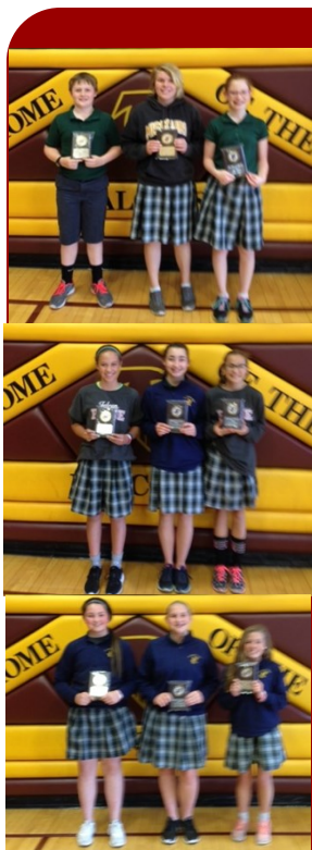
6th, 7th and 8th grade winners respectively.

“Fifty seven Saint Francis middle schoolers submitted entries into the 2016 Knights of Columbus Substance Abuse Awareness Poster Contest.”