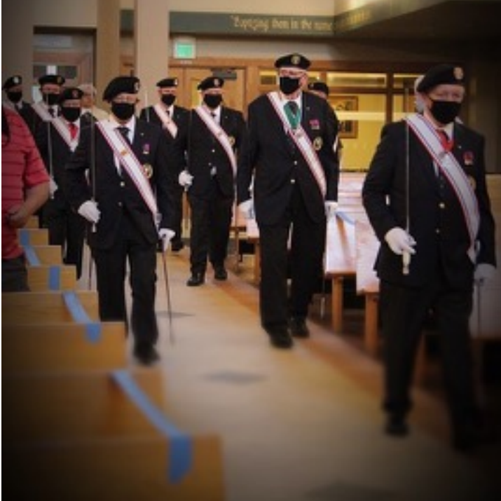
The Honor Guard march in during the opening procession.