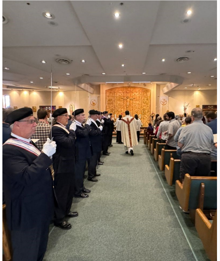
CORPUS CHRISTI MASS AND PROCESSION AT OLOG