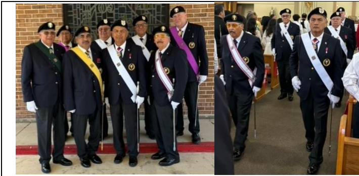
Our Assembly Assisted Assembly 2748 on Turn-out with Honor-Guard for Confirmation Mass presided by Aux Bishop Janak at St. Thomas More Catholic Church on 8 June