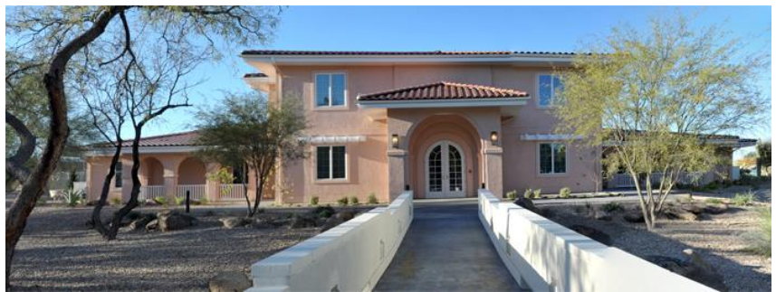
Tucson Fisher House

The Southern Arizona VA Health Care System (SAVAHCS) Fisher House in Tucson has 16 private suites for families of active duty or veteran patients and reside more than 50 miles from the Tucson VA Hospital.